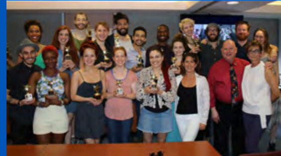
Equity Staff presents the Chorus of Natasha, Pierre & the Great Comet of 1812 the 9th Annual ACCA Award.