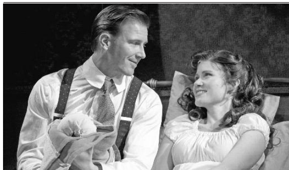
Derwent Award recipient Nina Arianda with Wes Bentley in Venus in Fur .