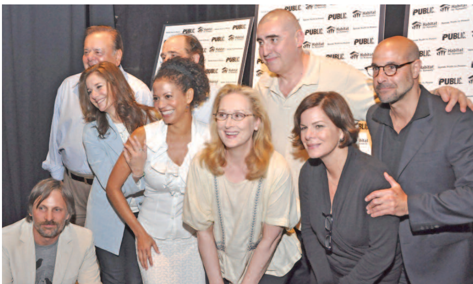
The cast of Speak Truth to Power: Voices Beyond the Dark .