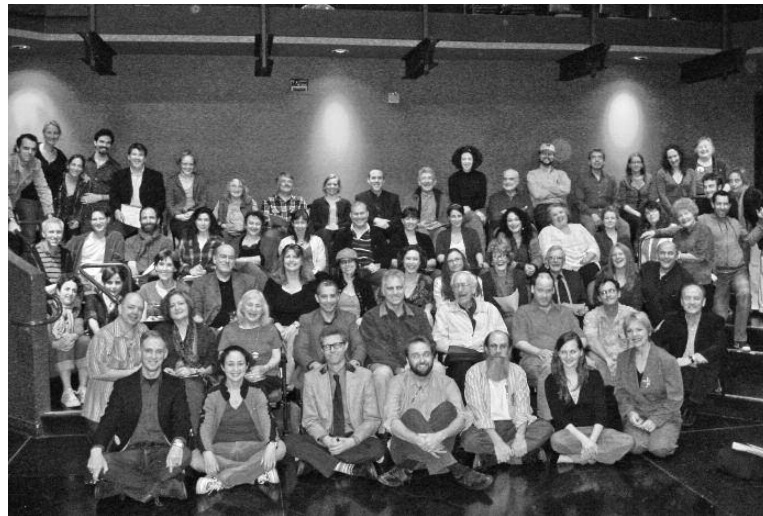
The crowd at the San Francisco/Bay Area Membership Meeting.