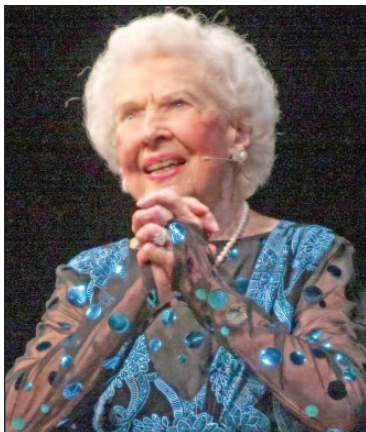
Doris Eaton Travis.