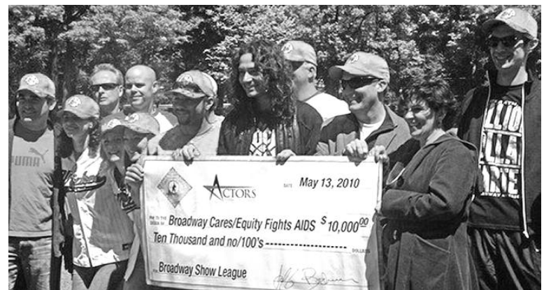
BSL supporters and friends.